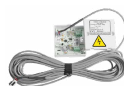
Detection Control Board MK010