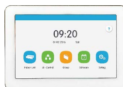
Wired Controller CE52-24/F