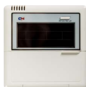
Wired Controller CE50-24/E