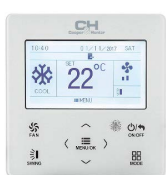
Wired Controller XK76